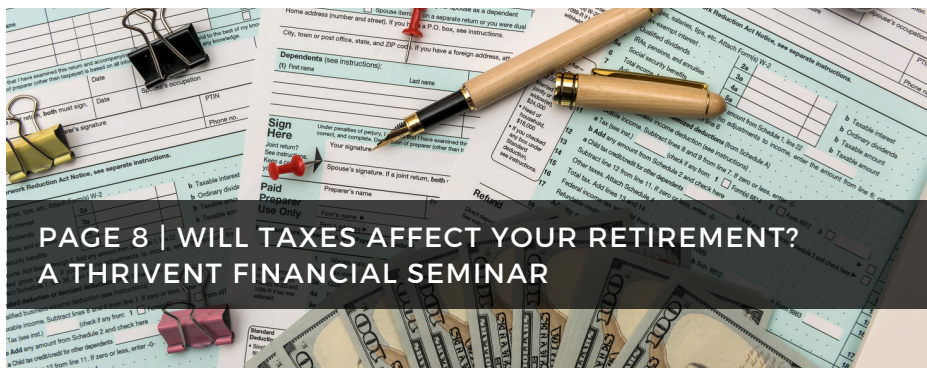
PAGE 8 | WILL TAXES AFFECT YOUR RETIREMENT? A THRIVENT FINANCIAL SEMINAR