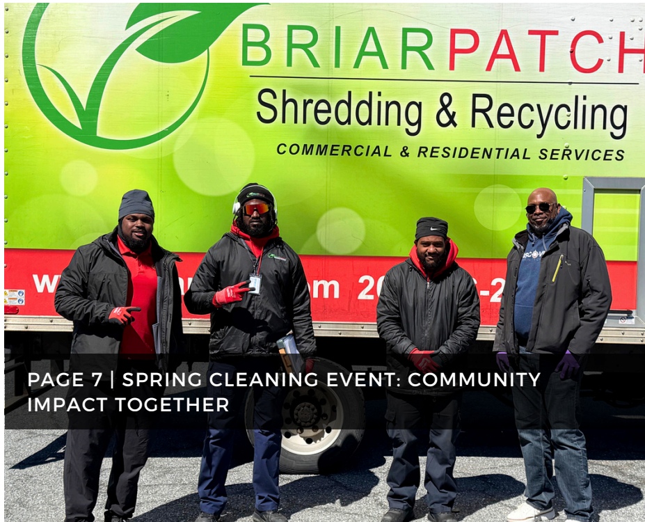
PAGE 7 | SPRING CLEANING EVENT: COMMUNITY IMPACT TOGETHER

How to start your Discover journey with intention. PAGE 6