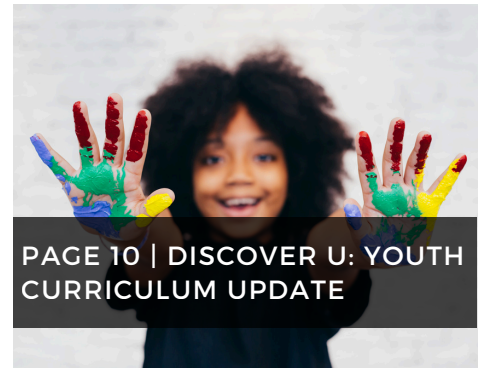
PAGE 10 | DISCOVER U: YOUTH CURRICULUM UPDATE