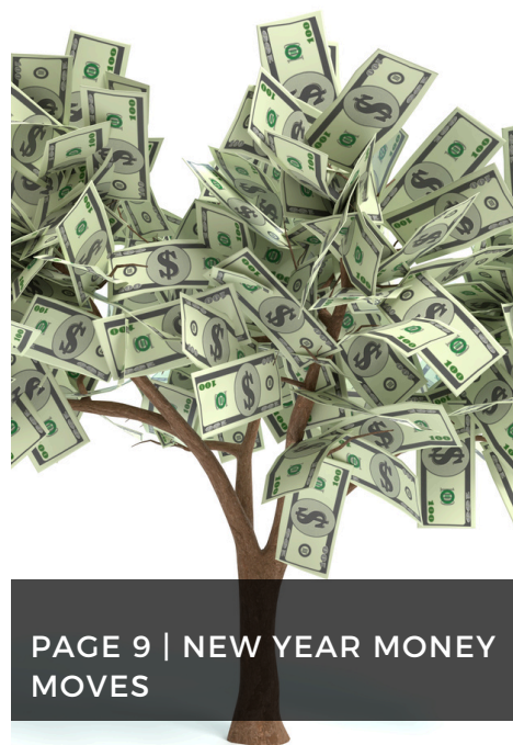
PAGE 9 | NEW YEAR MONEY MOVES