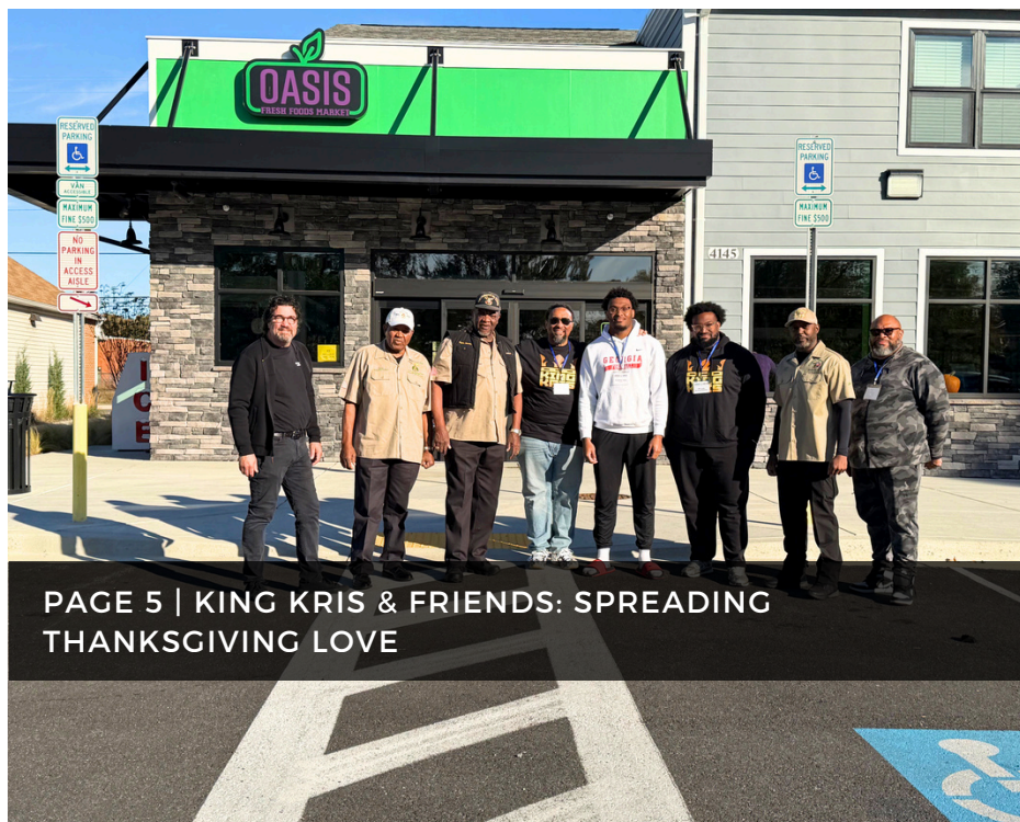
PAGE 5 | KING KRIS & FRIENDS: SPREADING THANKSGIVING LOVE