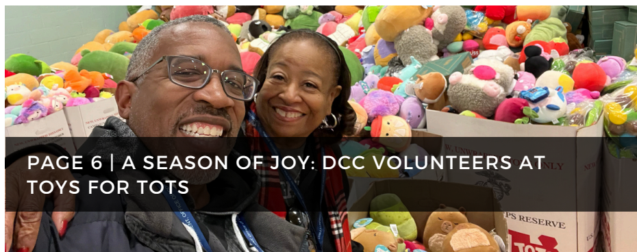
PAGE 6 | A SEASON OF JOY: DCC VOLUNTEERS AT TOYS FOR TOTS