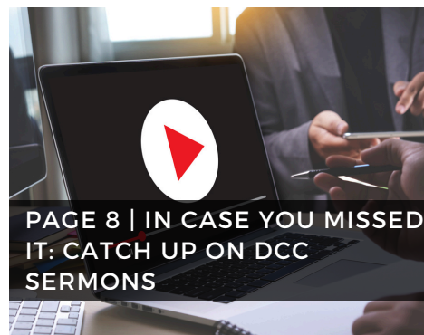
PAGE 8 | IN CASE YOU MISSED IT: CATCH UP ON DCC SERMONS