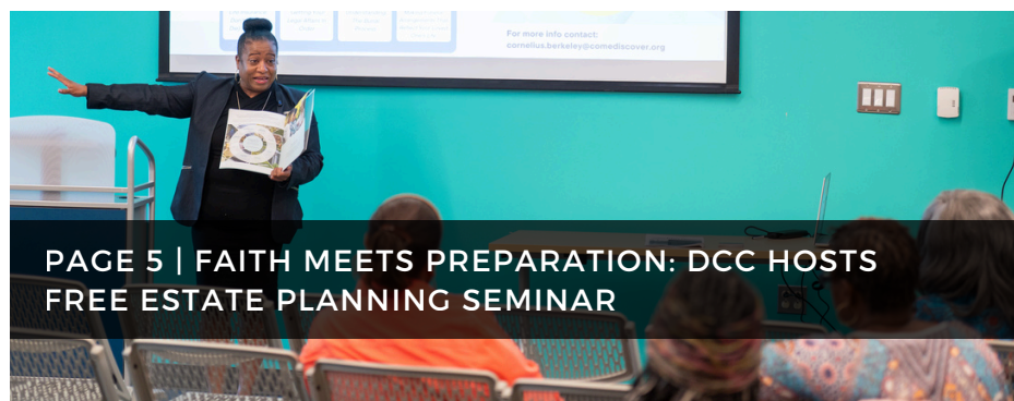
PAGE 5 | FAITH MEETS PREPARATION: DCC HOSTS FREE ESTATE PLANNING SEMINAR