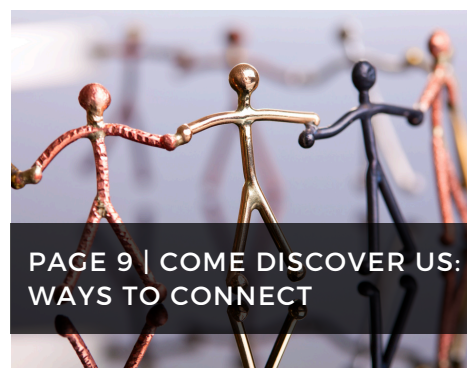
PAGE 9 | COME DISCOVER US: WAYS TO CONNECT