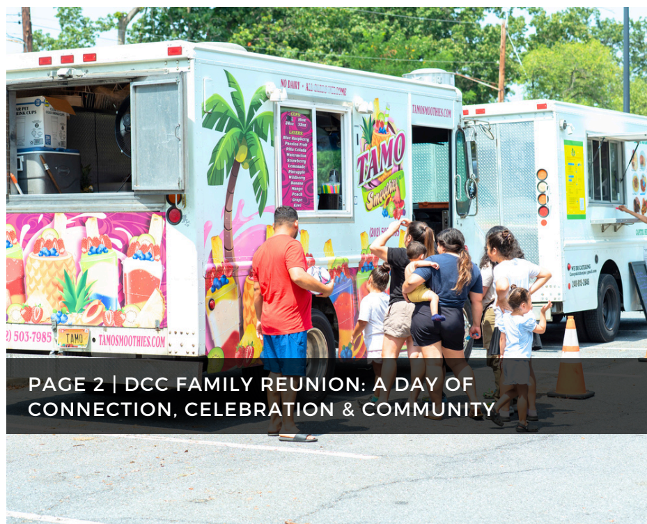
PAGE 2 | DCC FAMILY REUNION: A DAY OF CONNECTION, CELEBRATION & COMMUNITY