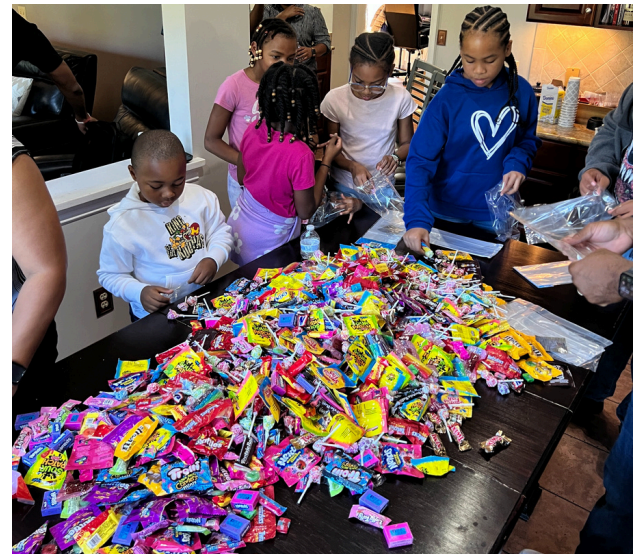
DCC volunteers packing candy bags for Patuxent Elementary's Trunk or Treat event.

We appreciate everyone who volunteered or contributed to these events! We look forward to more opportunities to share joy and create memorable moments with our community partners.