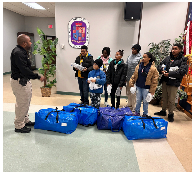
Our youth delivered 1295 pairs of socks to the Prince George's County District III station and had an opportunity to meet some of the officers.