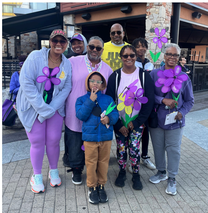
Team Discover is ready to walk!