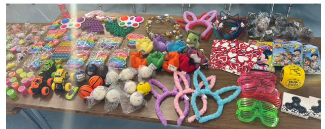
Some of the DCC donations for Santa's Gift Shop at Patuxent Elementary