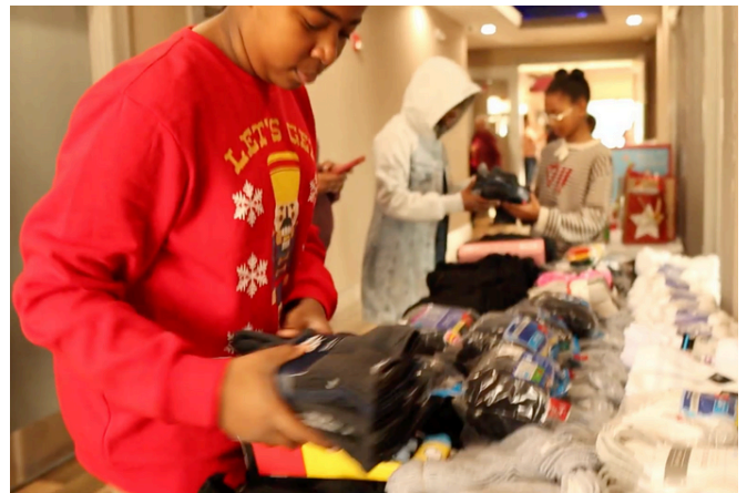
DCC youth volunteers counting and sorting the sock donations at DCC's Christmas Brunch.