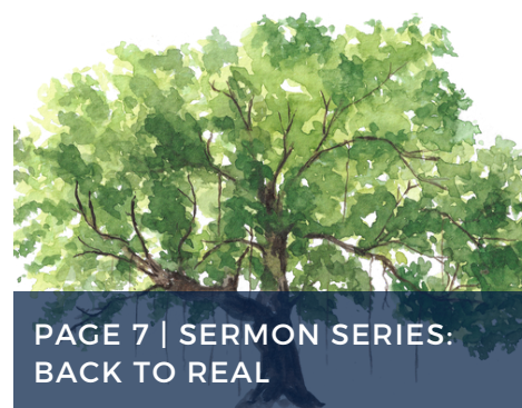
PAGE 7 | SERMON SERIES: BACK TO REAL