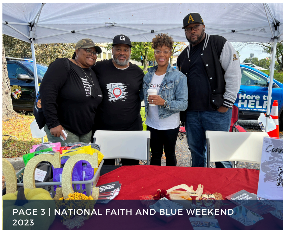
PAGE 3 | NATIONAL FAITH AND BLUE WEEKEND 2023