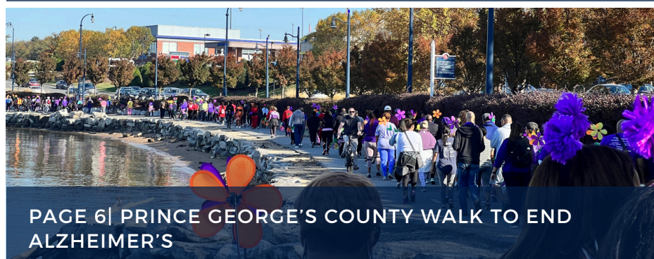
PAGE 6 | PRINCE GEORGE'S COUNTY WALK TO END ALZHEIMER'S