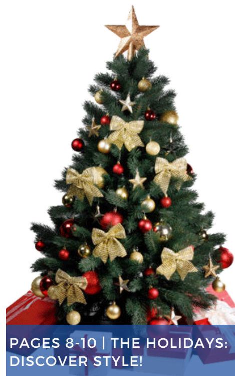
PAGES 8-10 | THE HOLIDAYS: DISCOVER STYLE!