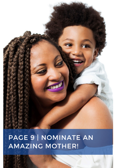
PAGE 9 | NOMINATE AN AMAZING MOTHER!