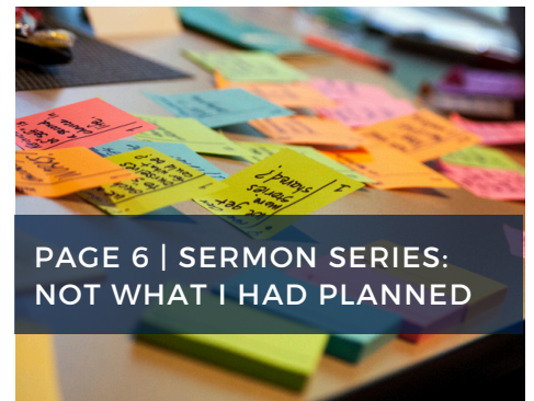
PAGE 6 | SERMON SERIES: NOT WHAT I HAD PLANNED