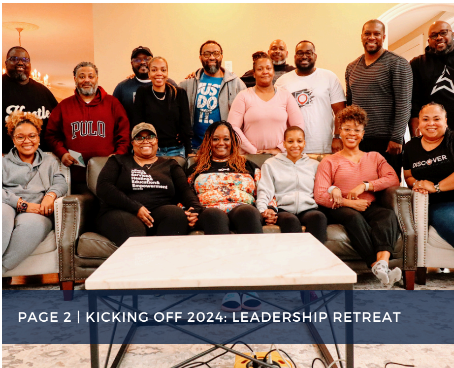
PAGE 2 | KICKING OFF 2024: LEADERSHIP RETREAT